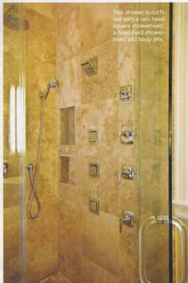
This shower is outfitted with a rain head, square showerhead, a hand-held showerhead and body jets.